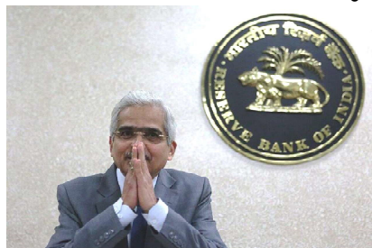
RBI Governor Shaktikanta Das

Similarly the Marginal Standing Facility rate was fixed at 4.25%.